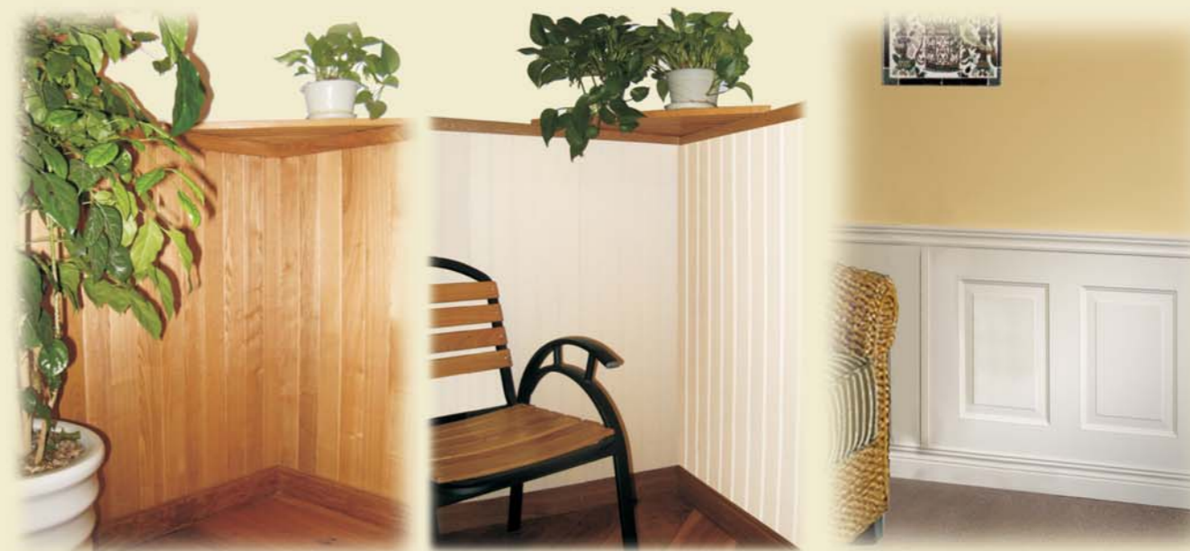
The Wall panel Collection