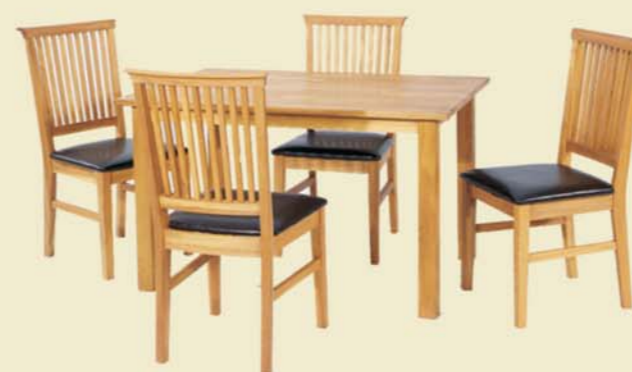
The Dining Rnage